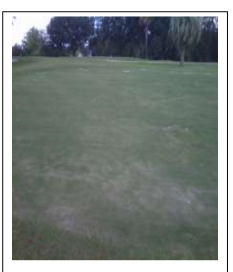
July 13, 2012